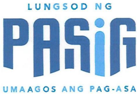
PASIG WORD LOGO LEFT AND RIGHT SIDE ACTUAL SIZE 20 X 29.75 INCHES