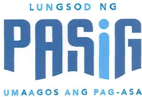
BACK PASIG WORD LOGO ACTUAL SIZE 14 X 20.5 INCHES