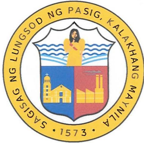
CIRCLE LOGO ACTUAL SIZE 11 X 11